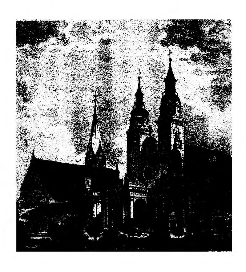
Volume 10, Number 3 November 2003