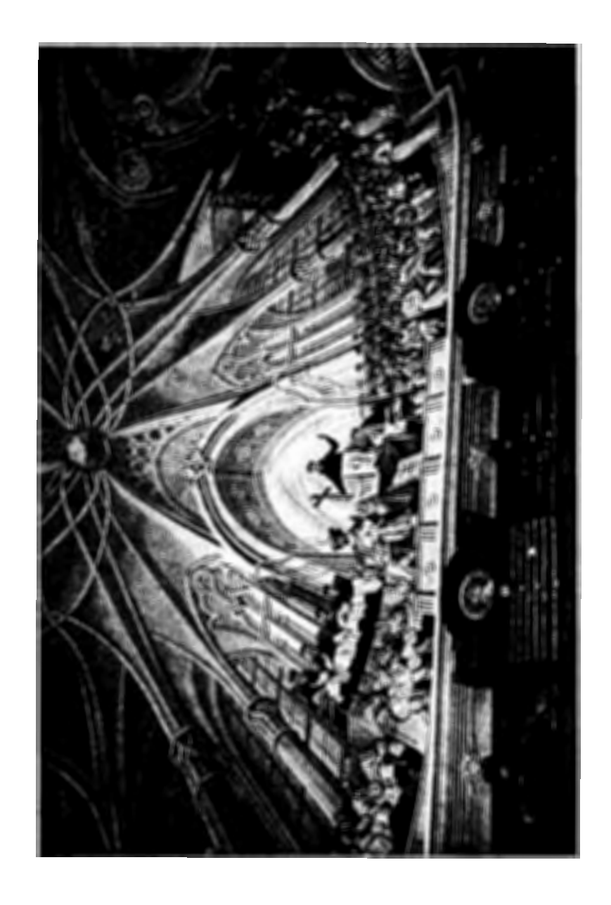
This fresco on the ceiling of the Archiepiscopal Library, Eger, depicts a session of the Council of Trent.