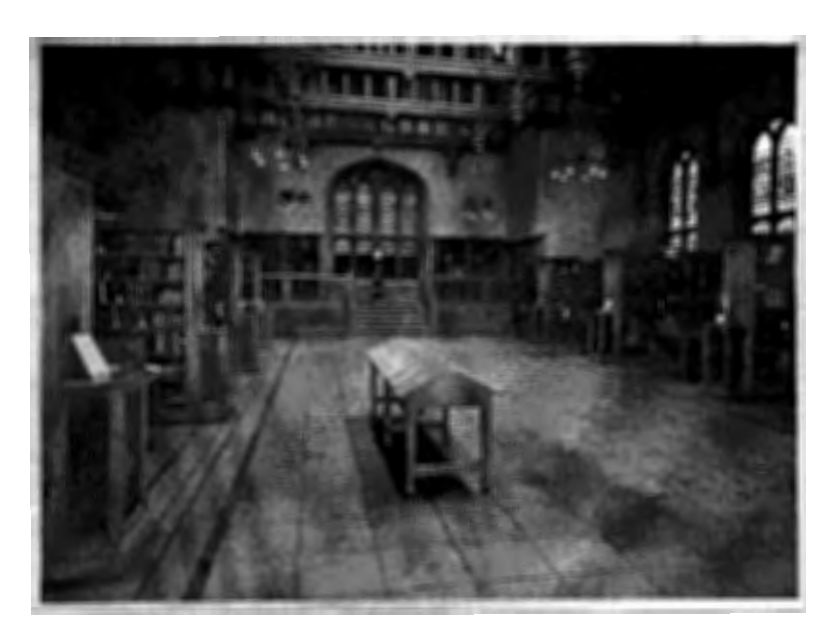
New College Library, 1946

University. It's a far cry from the first days of the library, when Hunter (1946: 196) described the early Reading Room as "most uncomfortable in its furnishings, and such a shivery place that few students frequented it". To see how the Library looks today, take the Virtual Tour available on the Library's website at <a href="http://www.lib.ed.ac.uk/resbysub/virtourdiv.shtml">http://www.lib.ed.ac.uk/resbysub/virtourdiv.shtml</a>