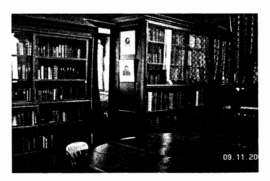
Library of Saint Botolph's Church, Boston