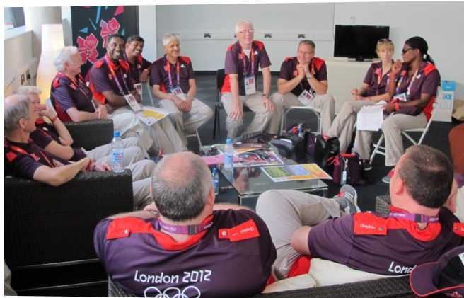
Chaplaincy meeting at the Games

ticket booth, gift shop, florist, restaurants and many others. All these are present to cater for various personal needs in the Athletes' Village. In the 'Faith Centre' spiritual needs are met. Not everyone needs everything. So it is for chaplaincy. For different people, chaplaincy may be either irrelevant or invaluable.