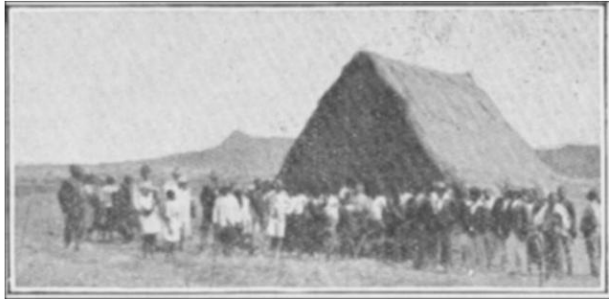
Opening of Mataffin Church, September 1, 1929.