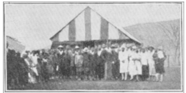
Opening of Joes Luck Church, September 15, 1929.

It has now been decided that Nelspruit shall be our headquarters, and there is a certain amount of building work to be done, which we are getting on with as quickly as possible because of the approaching summer.