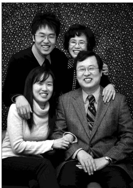
The No family