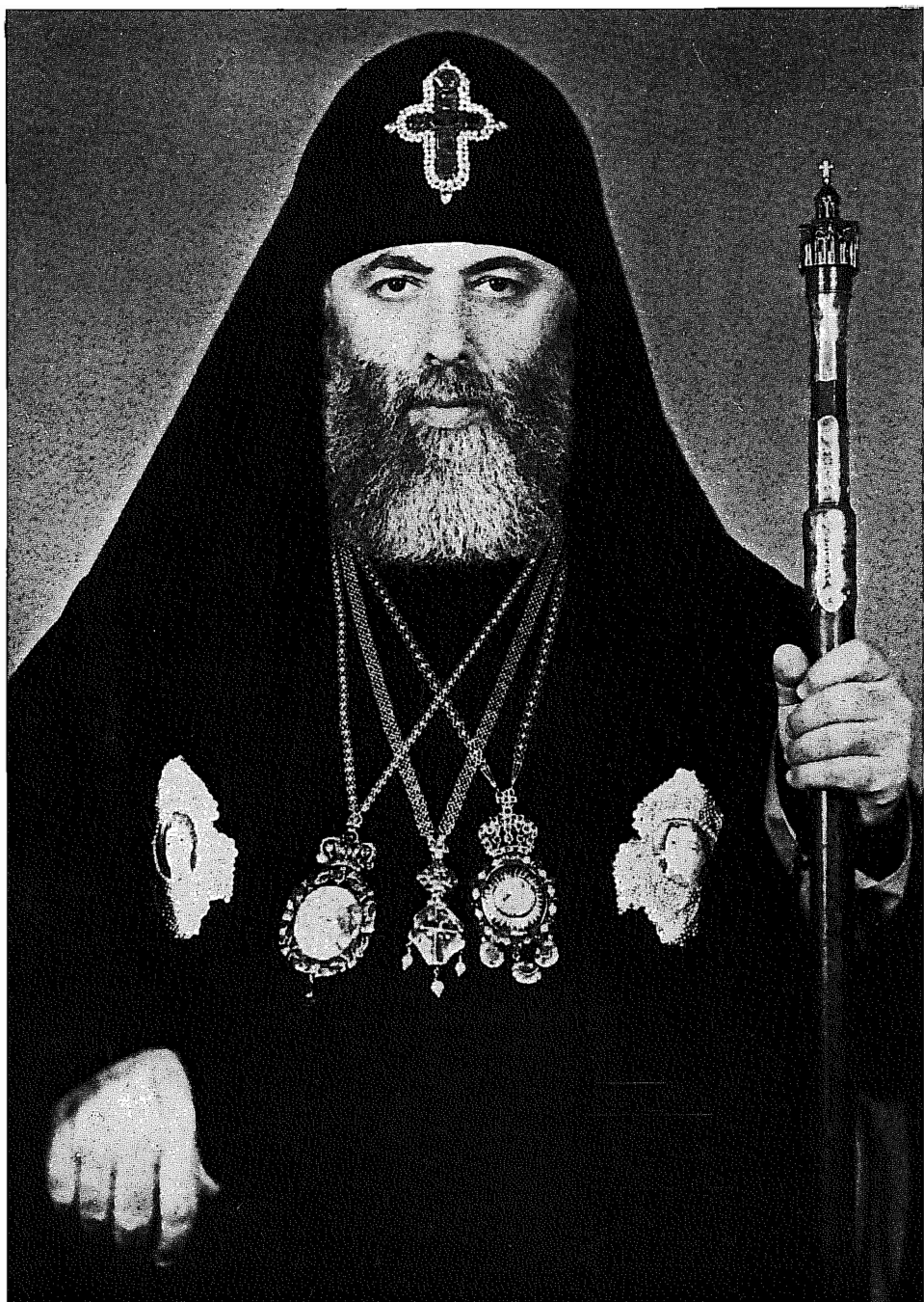
Patriarch Ilya II of Georgia who was elected on 23 December 1977 and enthroned two days later at the Svetitskhoveli Patriarchal Cathedral in Mtskheta. (See documents pp. 262-5)