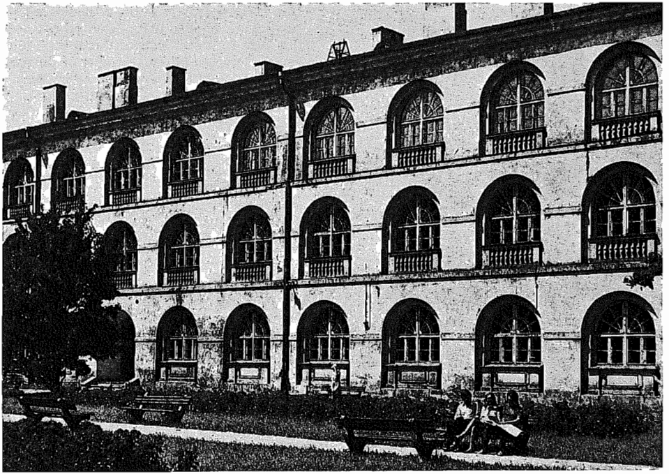
The Catholic University of Lublin (KUL), the only university in all the Eastern bloc countries which is not run by the State.