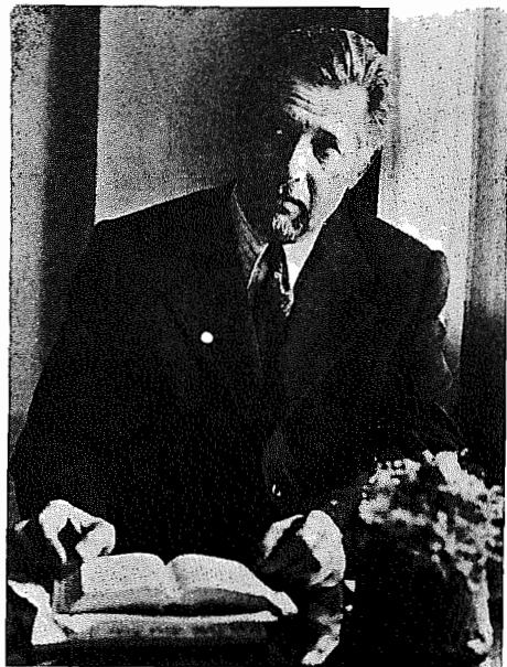
Pastor Georgi Vins, the Reform Baptist leader, who was released from prison in April 1979 and exchanged with four other Soviet dissidents for two Soviet spies. He is photographed here in May 1979 after his arrival in the US.