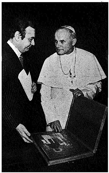
Right The Bulgarian foreign minister, Petar Mladenov, who had a private audience on 14 December 1978, presents an icon of SS Cyril and Methodius to the Pope.