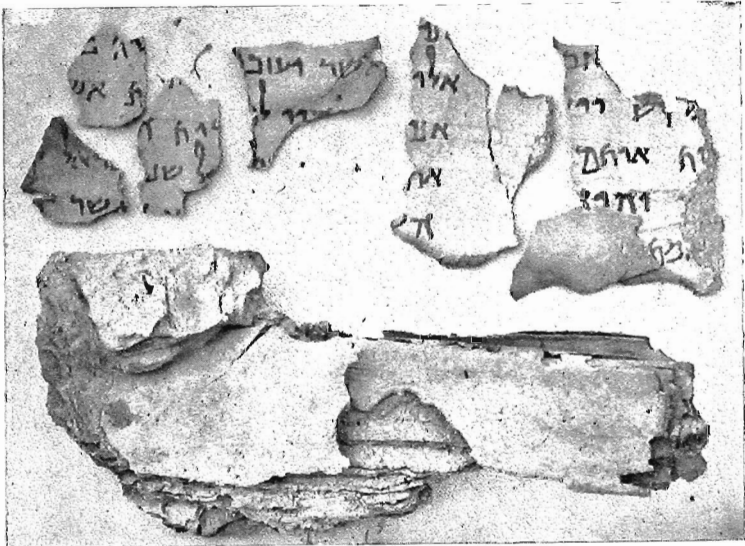
Parts of a scroll as yet unopened.