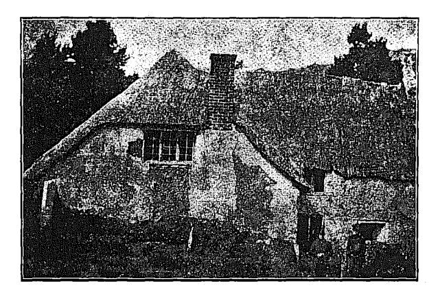
LOUGHWOOD IN DALWOOD, BUILT 1655.