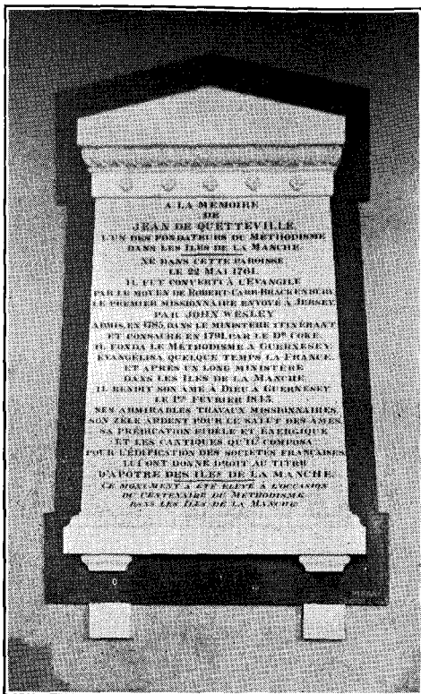
MEMORIAL TABLET IN THE CHAPEL AT ST. MARTIN, JERSEY