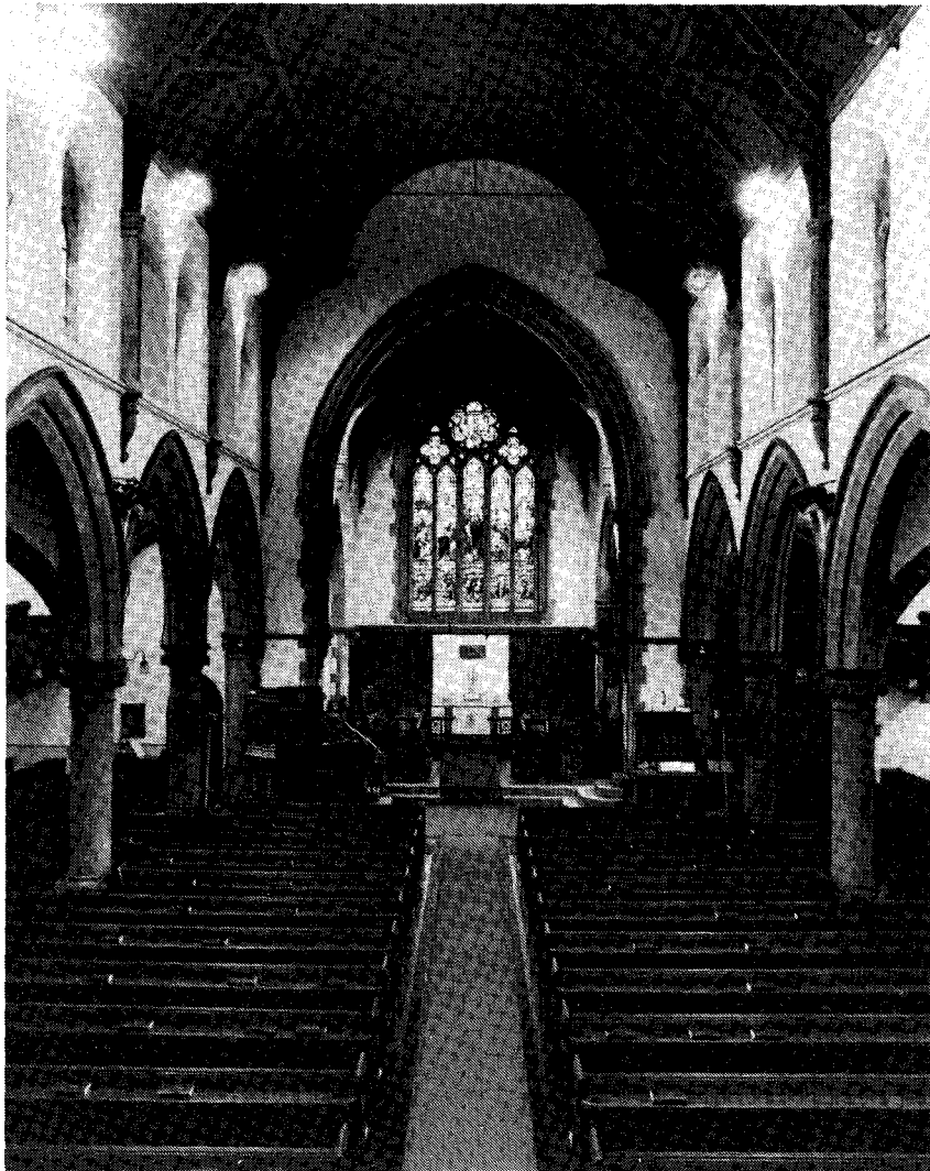
St. John's, Sunderland – Chancel and Nave