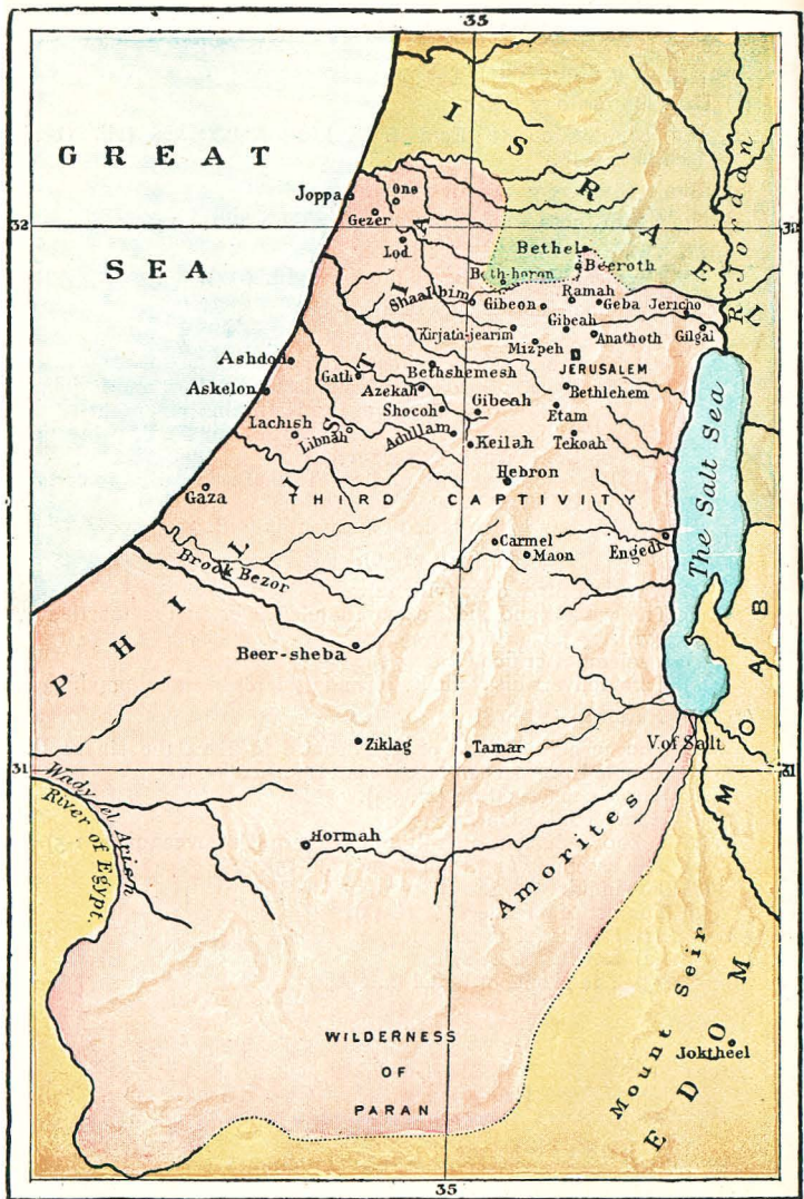
MAP OF THE KINGDOM OF JUDAH.