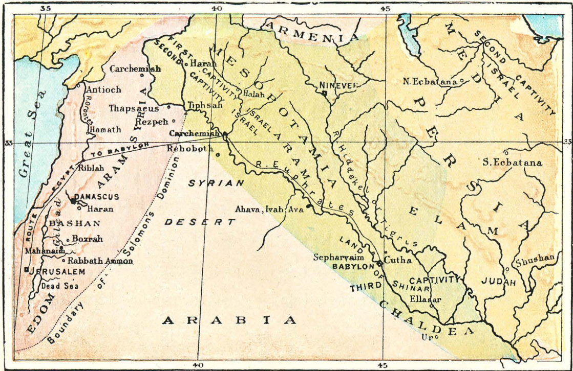
MAP OF THE CAPTIVITIES