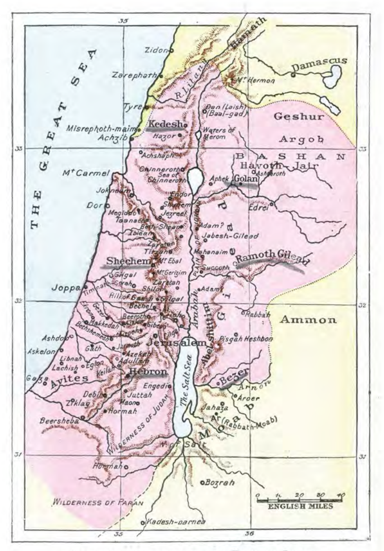
PALESTINE, TO ILLUSTRATE THE BOOK OF JUDGES.