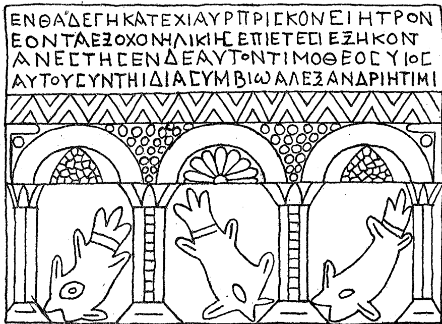
Tomb of a Christian Physician (see p. 298).