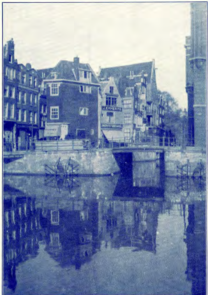
"And the street of the city was.. as it were transparent glass." —Revelation xxi. 21.

"I am come that they might have life." John X. 10.