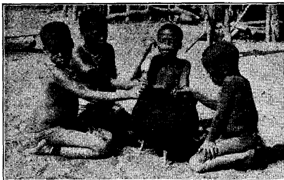
LITTLE CONGO BOYS EATING THEIR "MULEBELE" (PORRIDGE)

For some time the workers had been asking for revival among the girls and God answered by sending in their midst a beautiful young Indian woman who had taken her B.A. degree, and who came to be headmistress of the school. Noticing from the first something in her different from the other teachers, the headmistress later told the missionary how she became hungry for the Holy Spirit's fulness, and such was her hunger that she could hardly eat or sleep. One day she saw the Lord, and was filled with the Holy Spirit. She brought the touch of God to the school and something started happening. First it was noticed