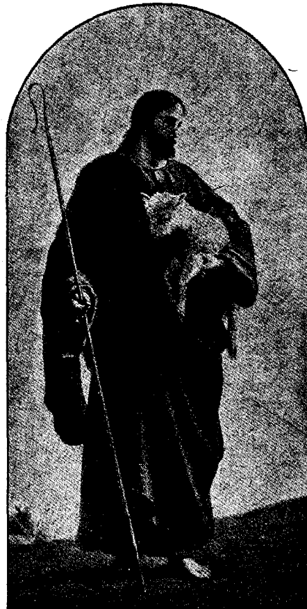
“Jesus Christ the same yesterday, and to-day, and for ever.”

The first chapter points back to the Cross and tells