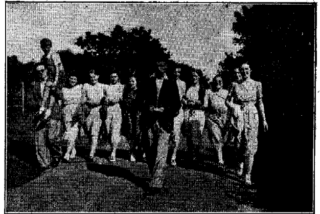
Elim Crusaders from our Crusader Holiday Home at Hayling Island enjoying a walk in the country.