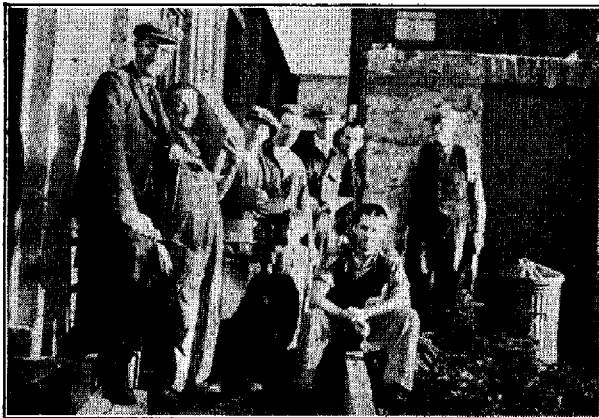
Above: Church members at Elim Tabernacle, Newtownards (Northern Ireland) erecting new boundary walls.