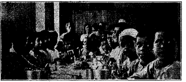
Some of the Port Said family at breakfast.

nets lest one fish should be lost. At this time of year, when sardines are so plentiful, they are clever to know just the days when the best and largest fishes will be caught. I do not pretend to understand how they know, but so many days are counted from the