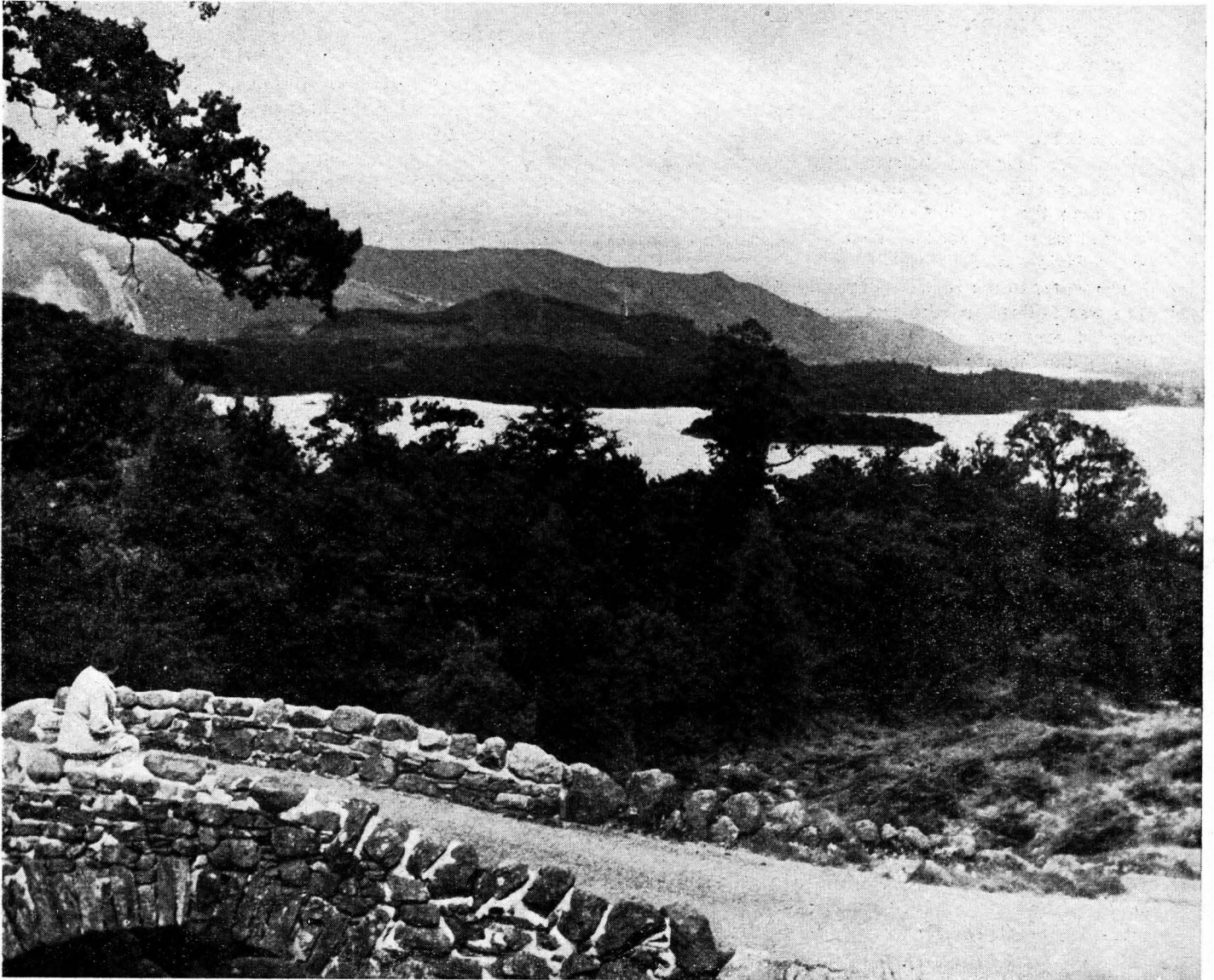
A Peaceful Scene in the Lake District