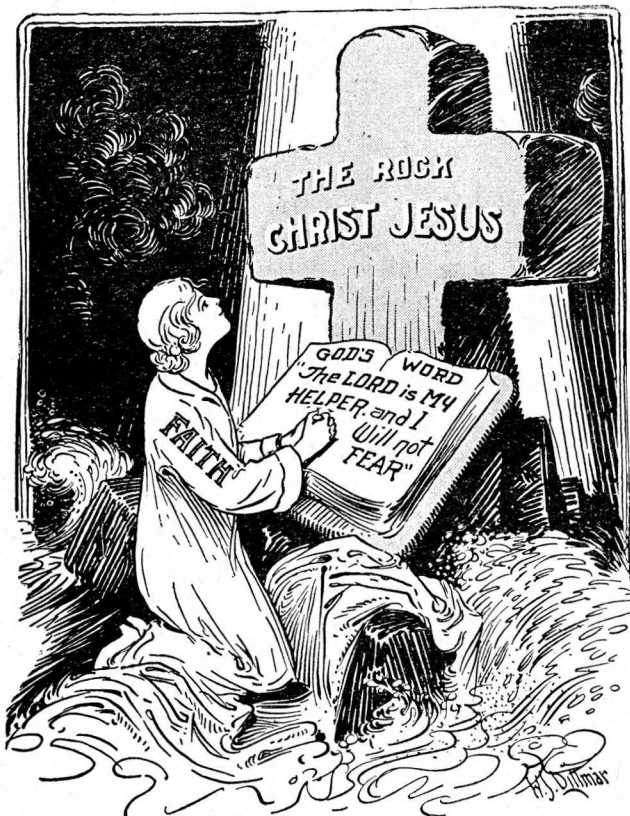
A touchstone in every time of sorrow and of need

“ May the Lord depend on you, Loyalty is but His due ; Say, O spirit, brave and true, That He may depend on you.”