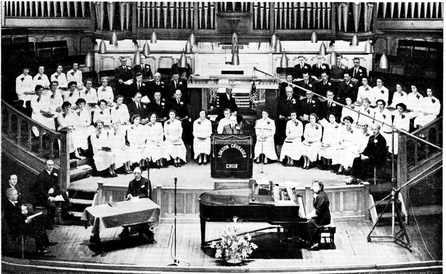
The London Crusader Choir in Kingsway Hall on the occasion of their recent 25th Anniversary.

Witnessing to the fulness of the Gospel of our Lord Jesus Christ