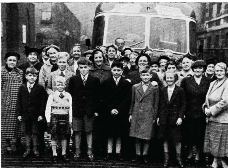
Some of the Edinburgh Sisterhood at the annual outing.