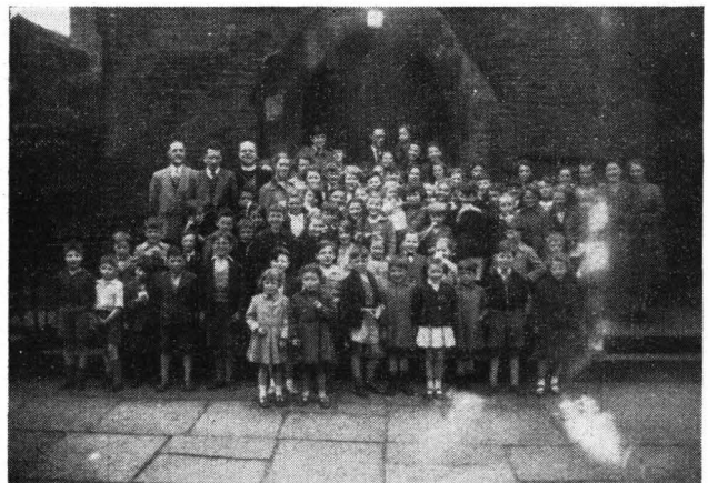
A Group of Huddersfield Children.