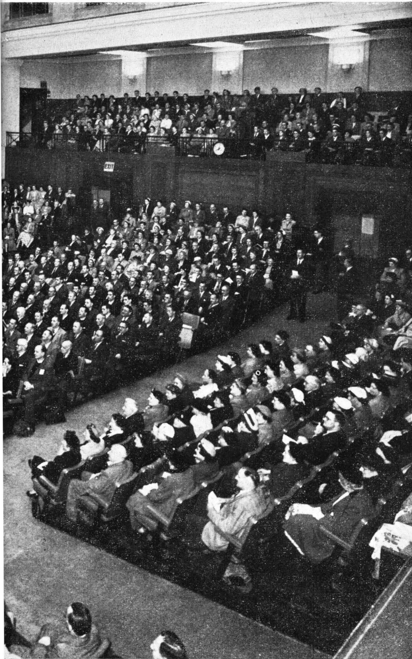
at the Induction Service in the Friends Meeting House, Euston Road, London.

responsibility of separate Churches. Not only in the large towns, but in rural districts the countryside caravan-evangelism had proved a success. Plans for future pioneer efforts in several towns are well in hand.