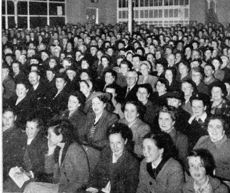
Section of the audience at the Guernsey Campaign.