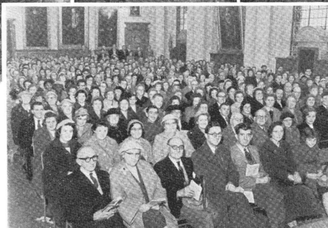
Bottom, section of the congregation.