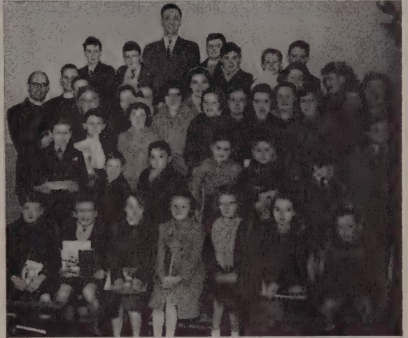
Scholars and teachers of the Sowerby Bridge Sunday school.

prizes for this year's examination, and in the meantime the teachers and the superintendent go on teaching the truth of the Scripture, knowing that His word shall not return unto Him void, but it shall accomplish that which He pleases.