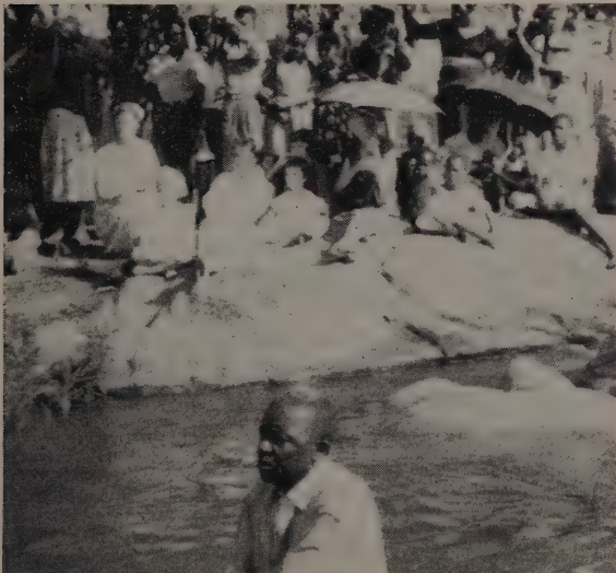
The African evangelist prepares to baptise candidates at Nelspruit.