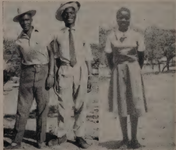
Three students in Miss Hurrell's class.