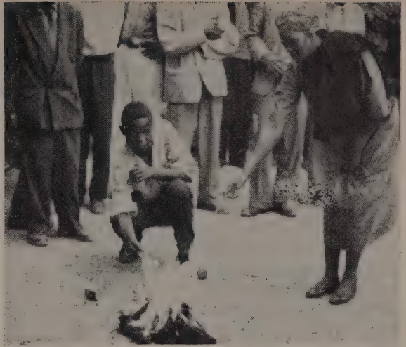
Two former witch doctors burn their charms before baptism at Nelspruit.