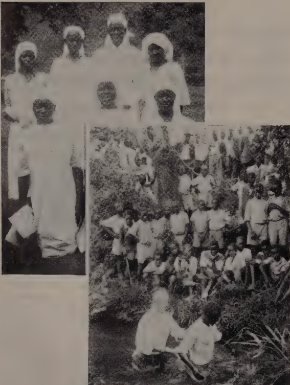
Candidates baptised at Inyanga North on Christmas Day, 1959.

A lump comes back to my throat when I recall how the congregation sang “Redemption, oh!