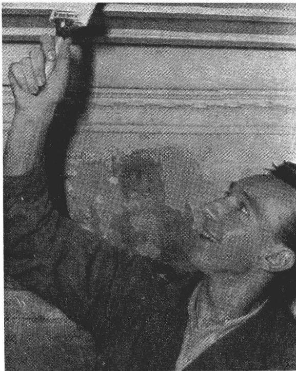
"Do it yourself" is the motto at E.B.C.

For the willing (and the unwilling) an interesting syllabus of hard labour is available, with plenty of variety, ranging from kitchen fatigues to a heavy gardening session. Every morning, Tuesday to Friday, 7.30 to 8, is governed by the Principal's principle of early morning exercise, "to get the blood flowing." Then every Monday is devoted to "work" in and around the college, correcting normal wear and tear (plus certain abnormal wear and tear). The college is privileged in having among the students tradesmen such as carpenters, bricklayers, electricians, etc., whose services have been extremely useful, particularly in the realm of recent alterations and expansion in accommodation to cater