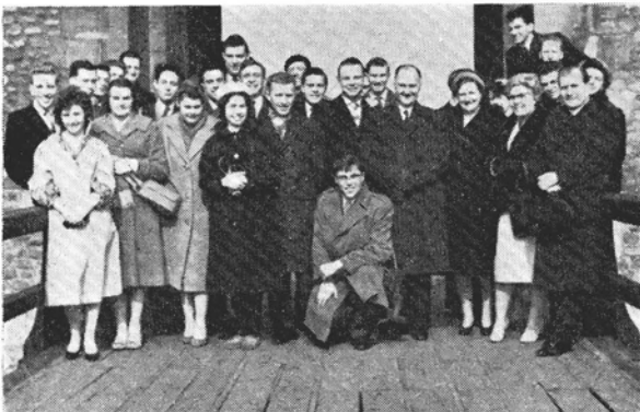
A visit to Cardiff castle on the Welsh tour.

If we have paid a visit to your church we thank you for the hospitality afforded us: we value your prayer as those of us who have completed our training go out into the work for God throughout the world. Please pray too for those now preparing to come into college in September that they may know God's blessing and guidance at all times.