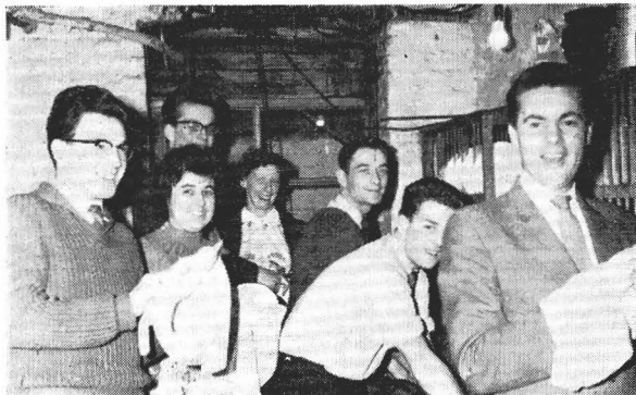
Dish washing is part of the training!

But do not be put off. Come and join us. The fellowship is simply grand.