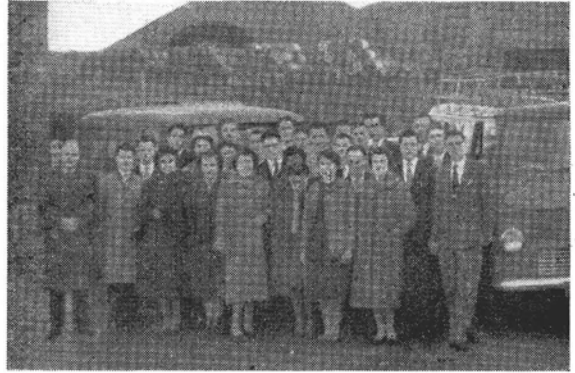
Students and their transport at Swindon.

In many of our visits where the opportunity has been presented, the work and need of the college have been illustrated by colour slides of life around the college. This has made a great impression upon those who have seen the college portrayed in this manner.