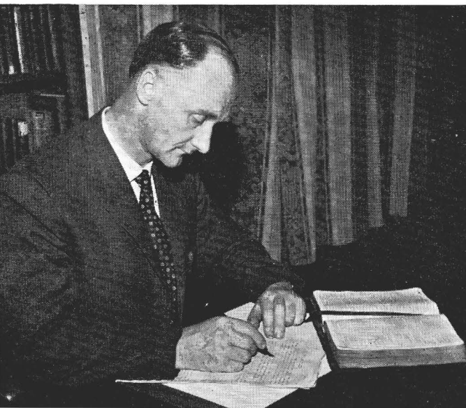
The Principal at his desk.

A prevalent outlook among students is that because they find themselves in Bible College they are made of "stouter stuff" than others, and in possession of charmed lives. Nothing is so fatal and calculated to lead blindly forward in pharisaic pride to pitfalls innumerable, and in the end to shattered illusions and the inevitable "O wretched man that I am." Experience has taught those responsible to recognise this from the start, and thus primary efforts are devoted to helping the novice to look himself in the face and be honest about what he sees there; to take stock of the perversity and deceptiveness of human nature at its best and to remember that he "has this treasure in an earthen vessel." Happy is the person who learns this at an early age and comes to understand that Christian service and vocation are not of "the stuff that dreams are made of," but that which partakes of the spirit and temper of the soldier and athlete who "keeps his body under, lest when he has preached to others, he himself should become a castaway." There is a