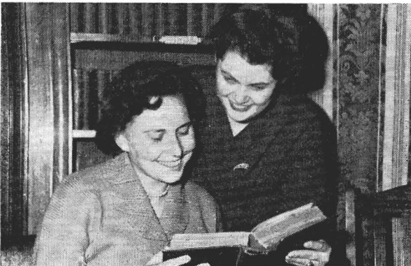
☆ ☆ "What does it say?" Two overseas students, from South Africa and Germany, study the Scriptures.