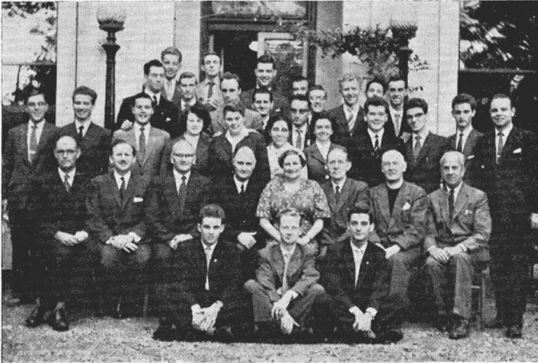
Bible College students together with the synod and members of the faculty.

Turning to the Old Testament, the historical books are studied and their message is ascertained. The major prophets present problems of authorship and date. Theological battles rage round most of