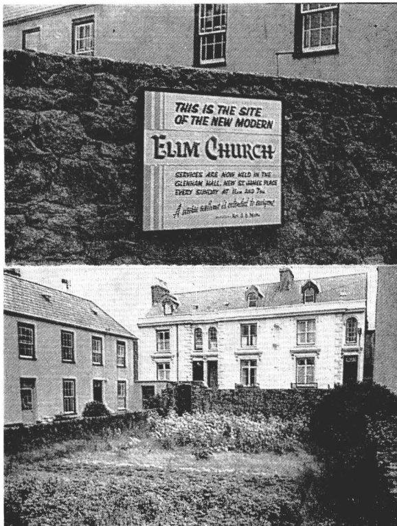
Views of the site of Jersey's new Elim church.