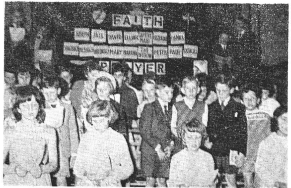
Anniversary demonstration at Swindon.

Surprises are not uncommon in Sunday school anniversaries, but it seemed a little different this time in Swindon. When the day arrived there was no one more surprised than the teachers, superintendent and minister. Fears were so numerous that after the final rehearsal someone suggested abandoning the whole project. Items were not remembered and there was little hope of remembering where each one should come in with their particular part. But the primary set the pace in the afternoon with a perfect