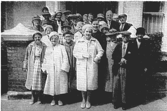
Senior citizens enjoy their holiday at Bexhill.

It would be good to point out that a number of our group were spending their first week's holiday. This was due to such an effort being arranged for them, also those living alone had the joy and opportunity of a week of fellowship with God's people. I am therefore confident that all returned home strengthened physically and spiritually. We have planned a holiday reunion for Saturday, October 26th, when plans for 1964 will be discussed.