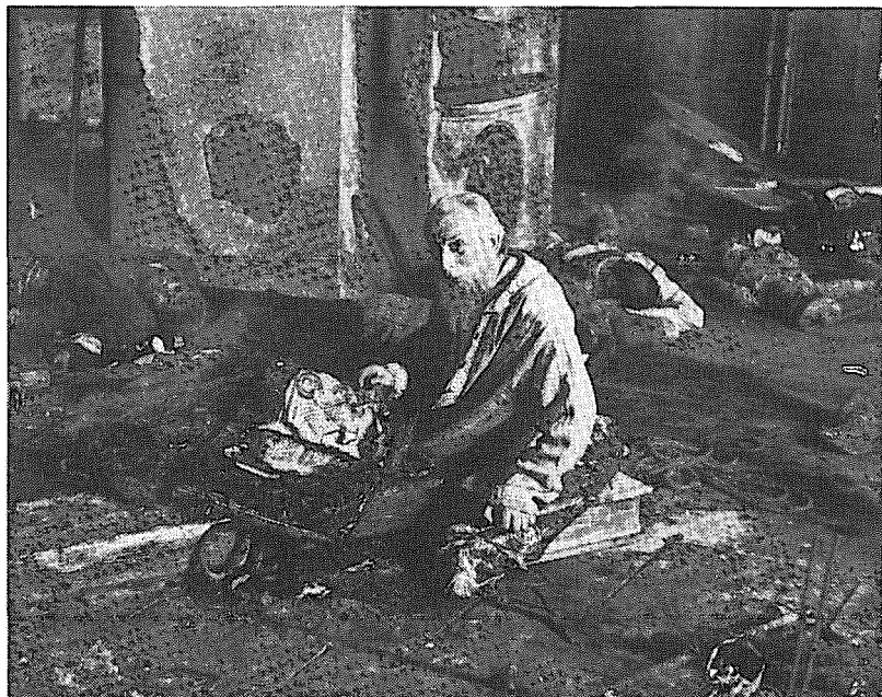
Scenes from Tarkovsky's film Andrei Rublyov . See article on pp. 210-226.