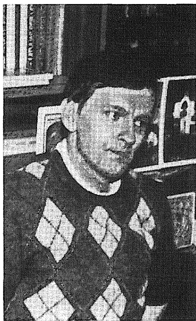
Dean Modris Plate.