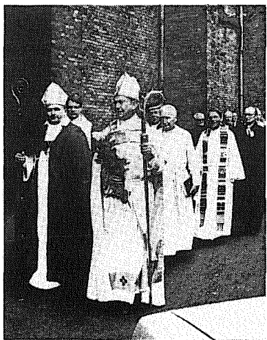
The consecration of Eriks Mesters as Archbishop of Latvia, August 1986.