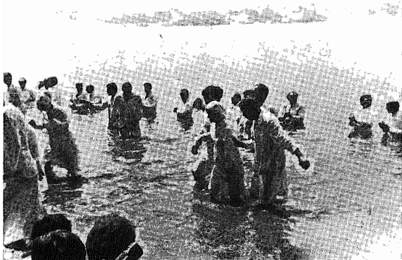
Newly baptised converts emerge from the River Dnieper.